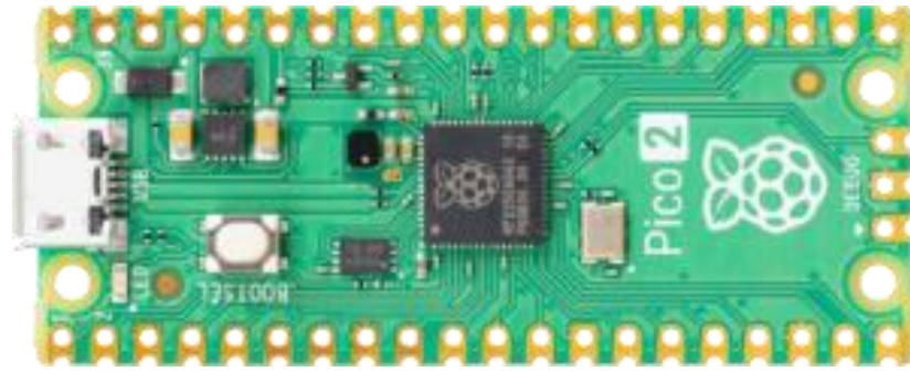
Raspberry Pi Pico 2 W[/caption]

[caption id="attachment_108271" align="aligncenter" width="411"]